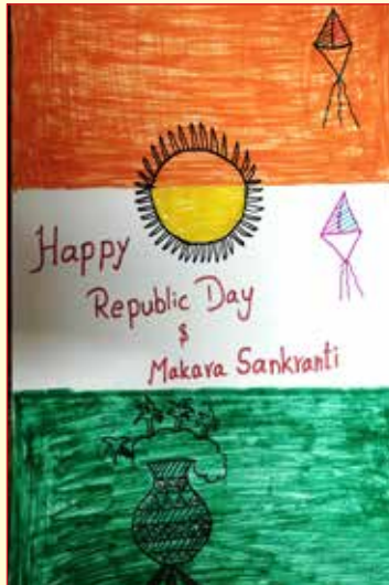
N. Devansh Sai - Prep 2