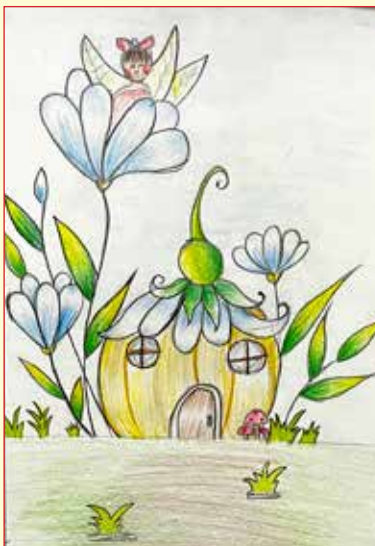
Sai Shravani - Grade 7