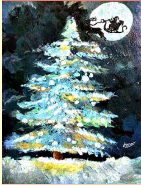
Aruna - Grade 8