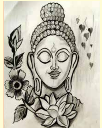
Niwang - Grade 8