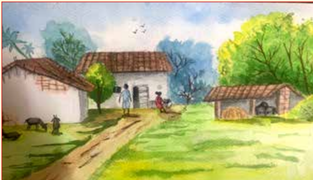
Devangshi Guha - Grade 6