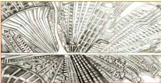
Eenakshi - Grade 7