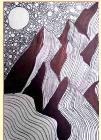
Roshni - Grade 6