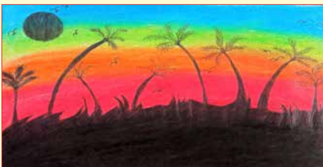
Rishi Atreya - Grade 5