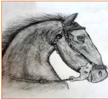
Pradnyesh - Grade 7