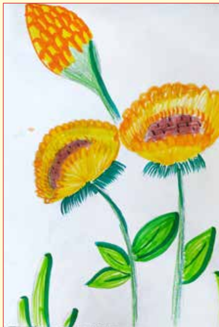
Saachi - Grade 6