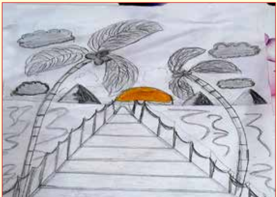
Shreaya Pandey - Grade 6