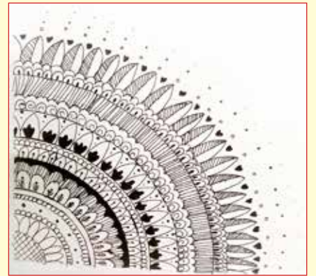
Vedhswaroop Subudhi - Grade 8