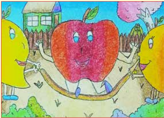
Saanvi - Grade 4