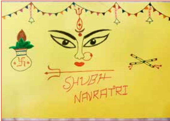
N. Devansh Sai - Prep 2