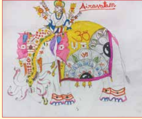
P. Nadin - Grade 6