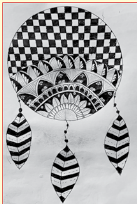
Yogitha - Grade 5