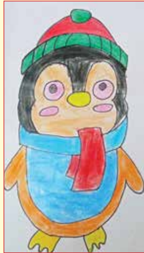
Aadya R. - Grade 2