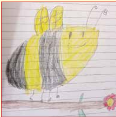
Dhanya - Grade 1