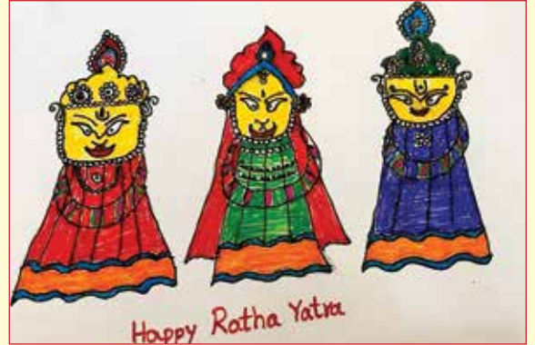
Happy Ratha Yatra N. Devansh Sai - Prep 2