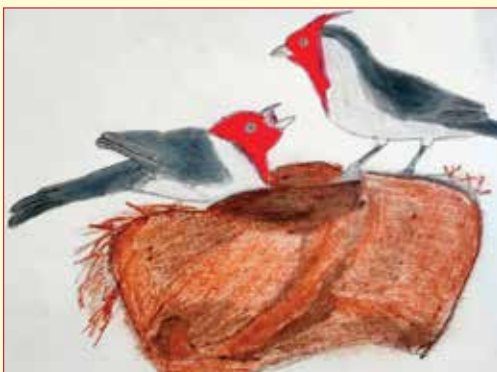
Redagri Arvety - Grade 6