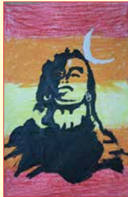
Saransh S. - Grade 5