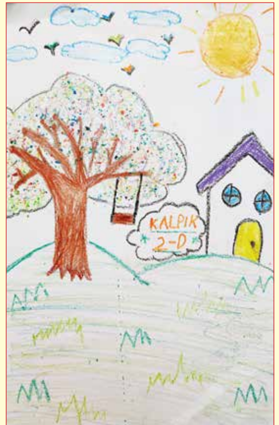
KALPIK 2-D Kalpik Arvety - Grade 2