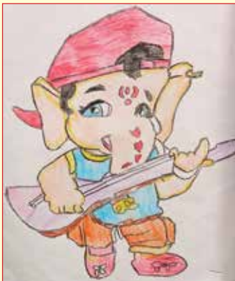
Shravan Nayak - Grade 4