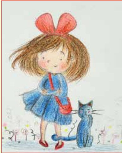
Aditree Dey - Grade 3