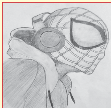
Pradnyesh Trigule - Grade 7